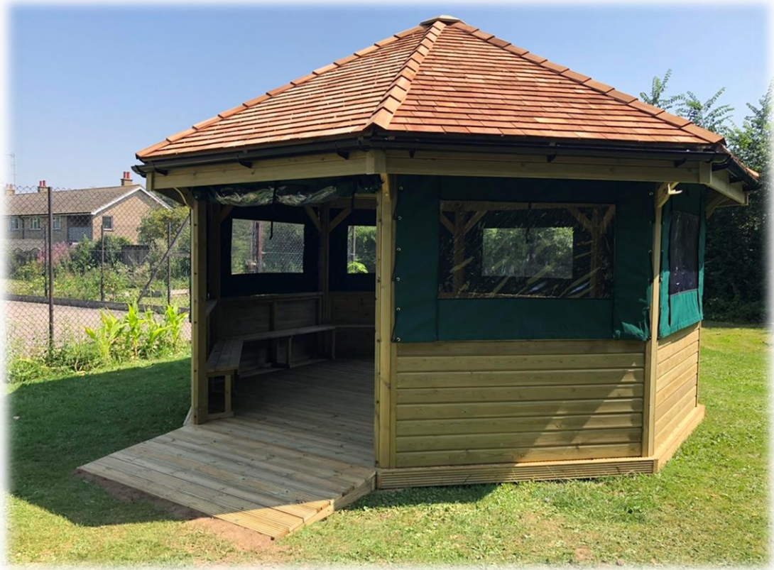
Cedar shingle tile roof