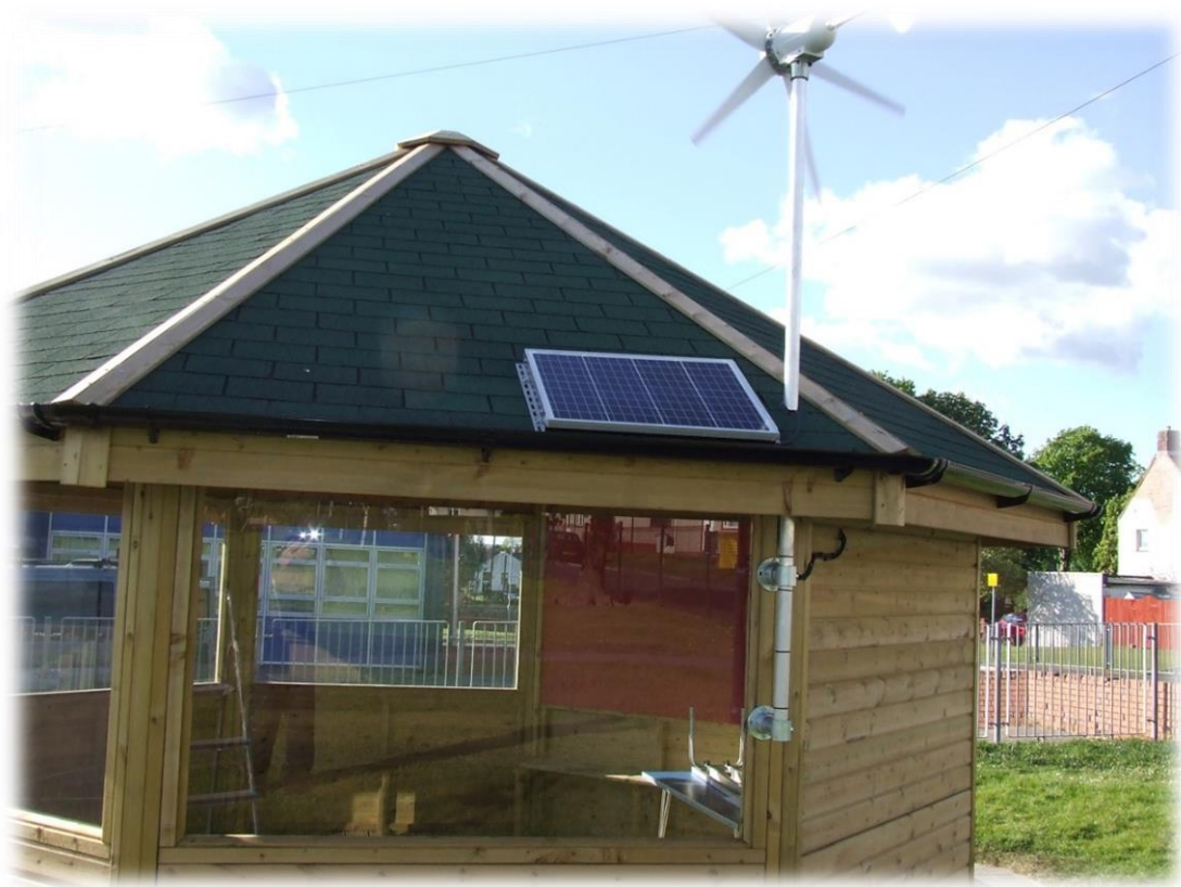
Renewable energy equipment with monitoring board, light and power sockets