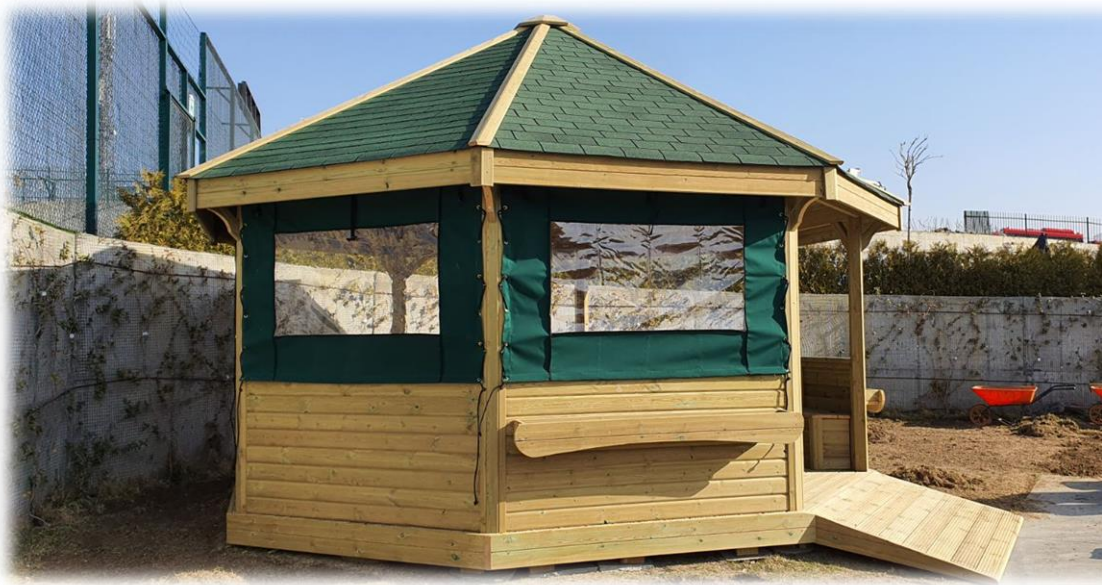
Roll-down canvas panels, flower boxes and water butt system