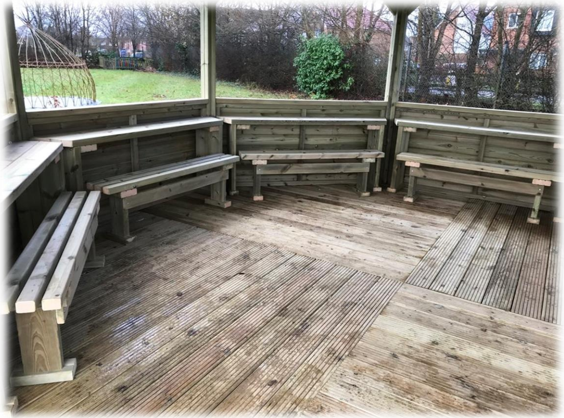
Internal benches and desks