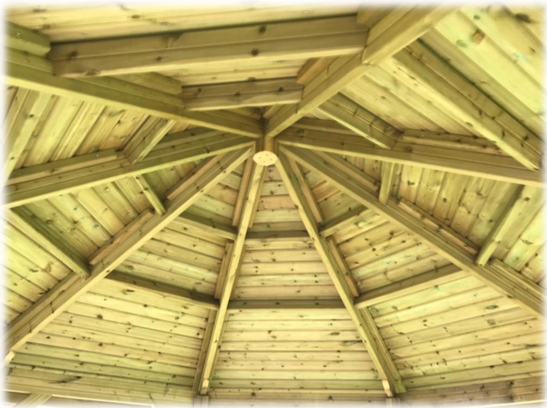
Ceiling in tanalised grade 4 pine log